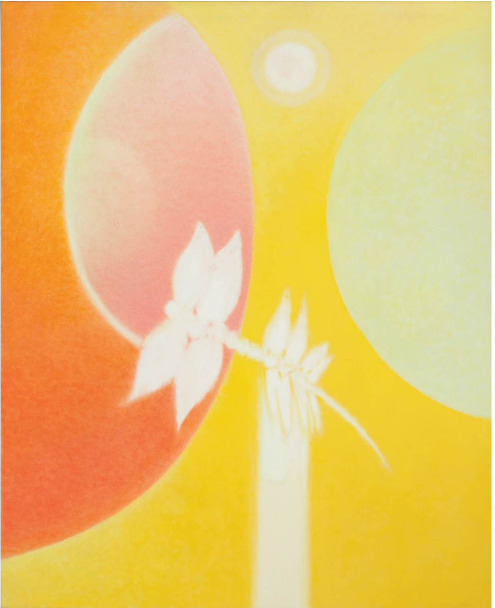
Outrider , 1972. Oil on linen, 62 x 51 inches