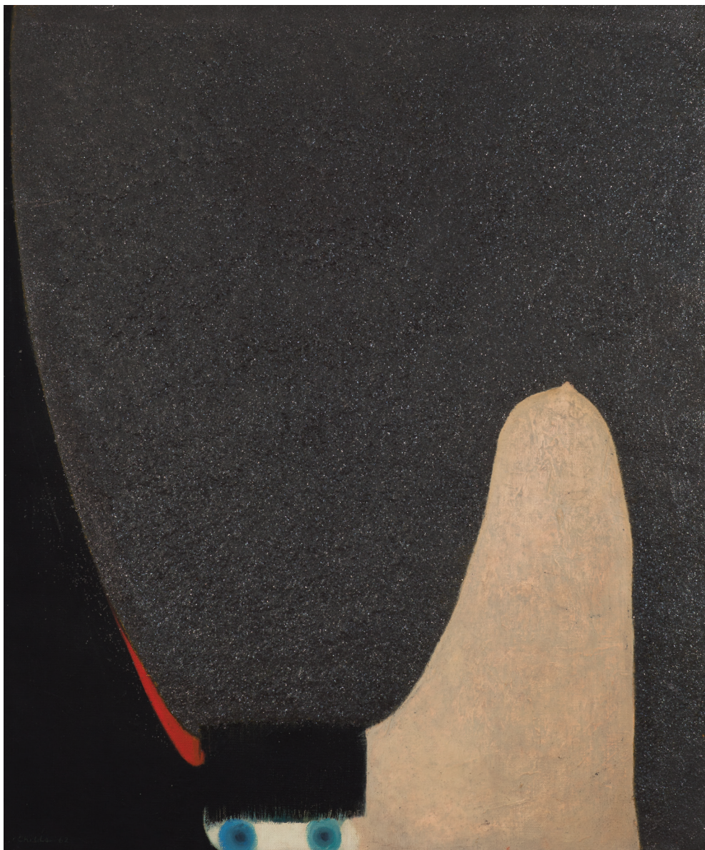
Carmen , 1962. Oil, carborundum and graphite on canvas, 21¼ x 18¼ inches