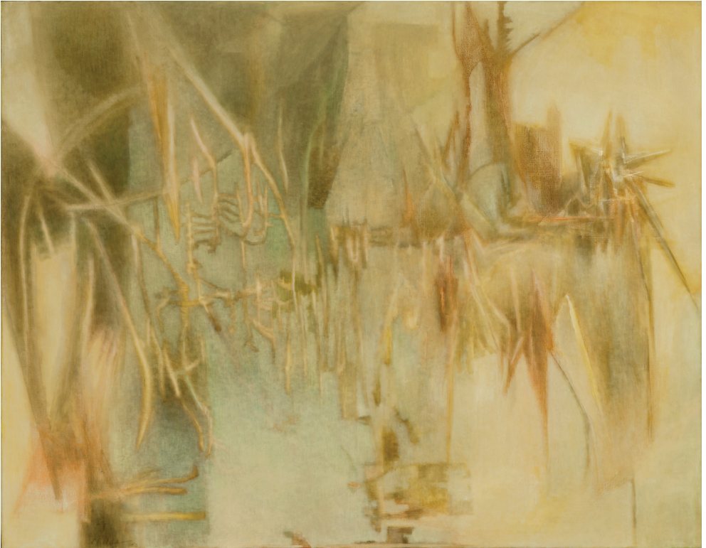
Le Forêt (sic) , 1953. Oil on canvas, 45 x 57 inches