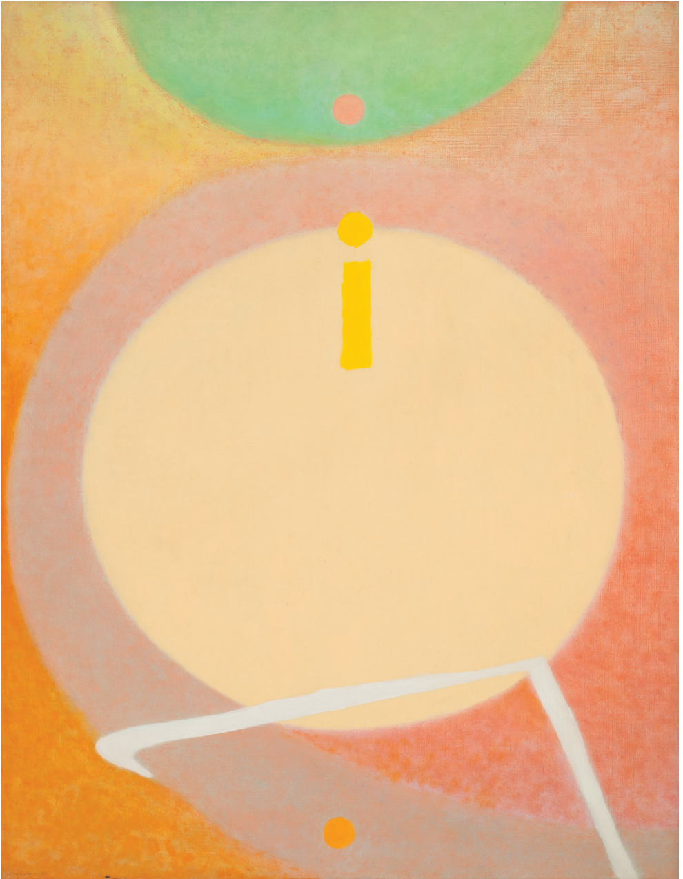
Round the Bend (Requiem for Y. Tabuchi, père) , 1975. Oil on canvas, 25 7 / 16 x 18 1 / 4 inches