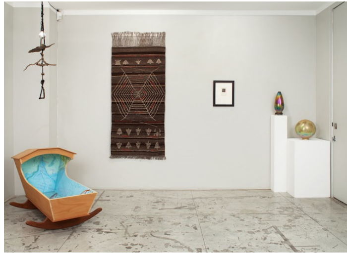
Installation view, 'Domesticity' at Jason McCoy Gallery