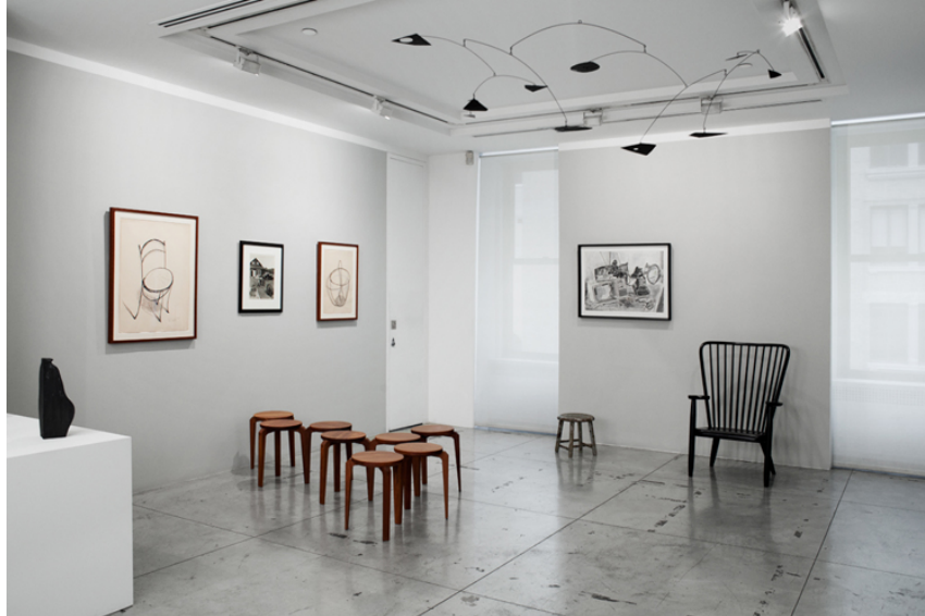
Installation view, 'Domesticity' at Jason McCoy Gallery